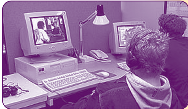
Student using a video clip available on the intranet site.

The pilot site has been developed in collaboration with the