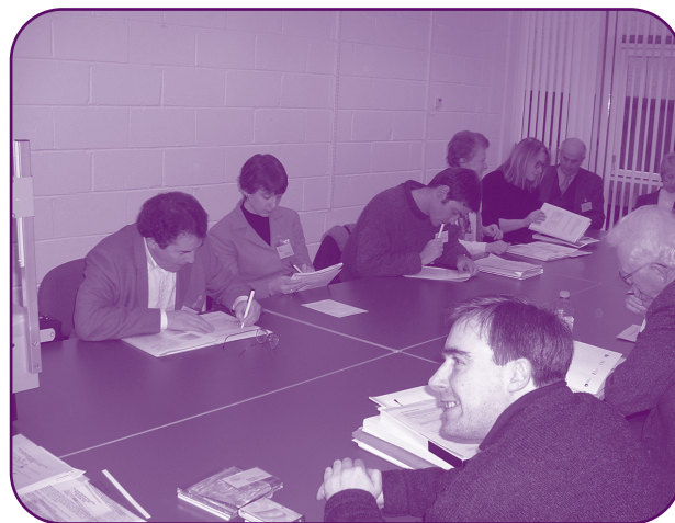
Getting down to some serious work at the Stirling Roadshow.

Education is an important component of the new knowledge-based society, and co-operation is well recognised within the knowledge economy as a crucial strategy for achieving better use of our resources and a big extension to our traditional markets. It stimulates innovation and enables us to meet diverse needs. Co-operation only appears to be limited by our imagination and by the resources we have at our disposal. By working together, we can expand both.